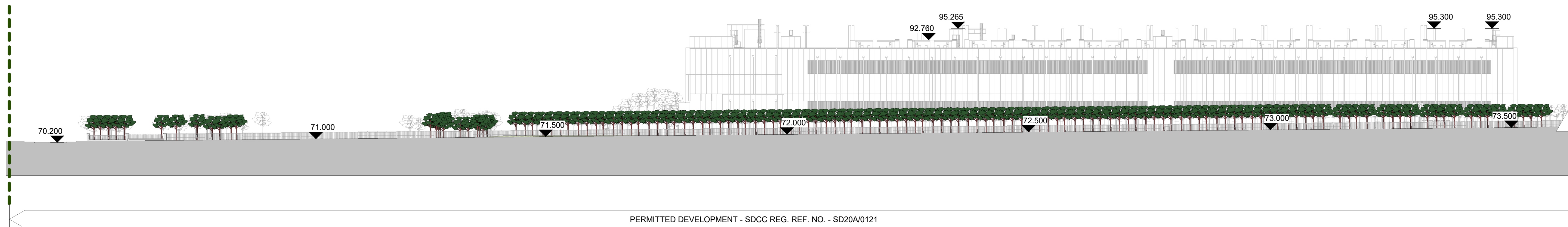
2 PERMITTED CONTIGUOUS ELEVATION - SOUTH (A) 1 : 500